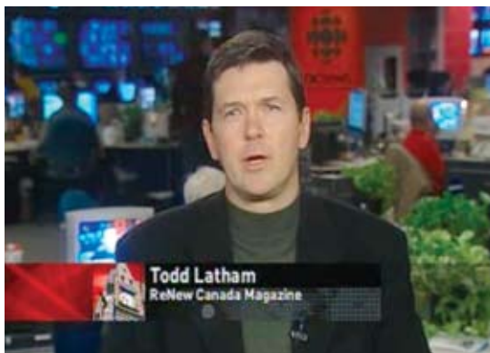
ReNew Canada publisher was interviewed live on national news about the Top100 listing and Minister Baird's stimulus federal announcement on Jan. 26, 2009.

The Top 100 infrastructure projects report in Canada received coverage in the Globe & Mail, Canada.com, National Post, Journal of Commerce, the Calgary Herald and CBC News, as well as a long list of Blogs and local news outlets.